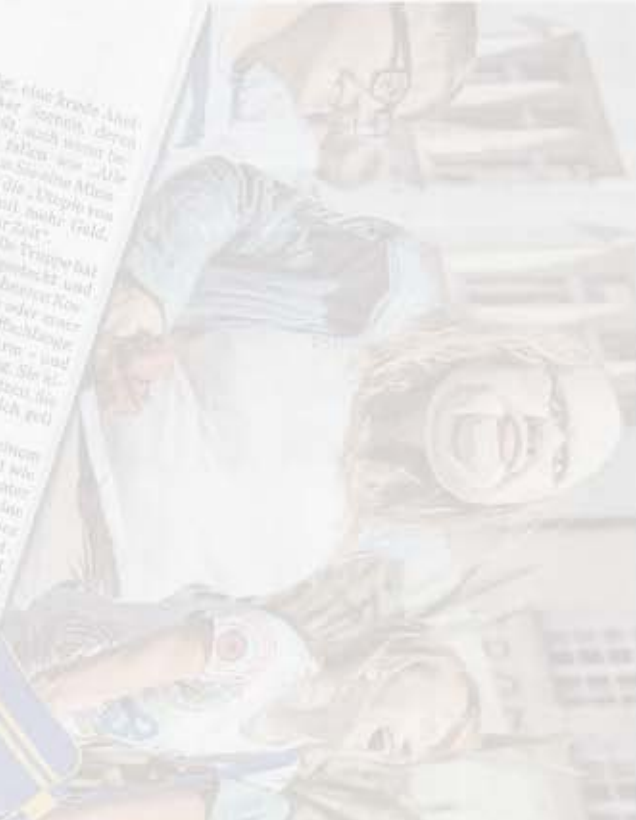
... Theater ...